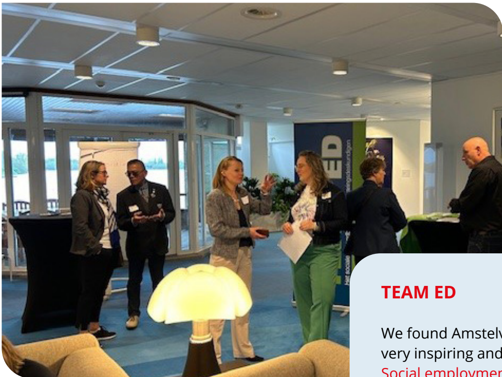
TEAM ED We found Amstelveen Connect to be very inspiring and valuable. TEAM ED Social employment agency for experiential experts